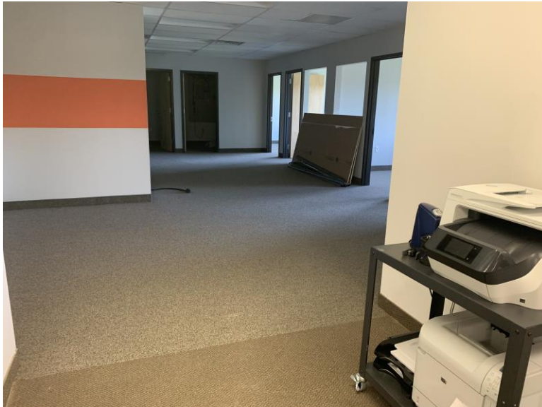
CQ fluency’s growth resulted in office expansion and optimization to accommodate more employees

“The companies on this year’s Inc. 5000 have followed so many different paths to success,” says Inc. editor in chief James Ledbetter. “There’s no single course you can follow or investment you can take that will guarantee this kind of spectacular growth. But what they have in common is persistence and seizing opportunities.”