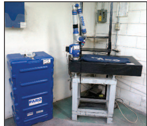
Faro Platinum Arm