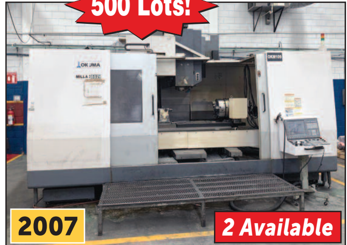
Okuma Millac 852V 4-Axis VMC