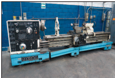
Takoma CW6280E/3000 HD Engine Lathe