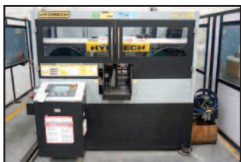
Hyd-Mech H-11A CNC Band Saw