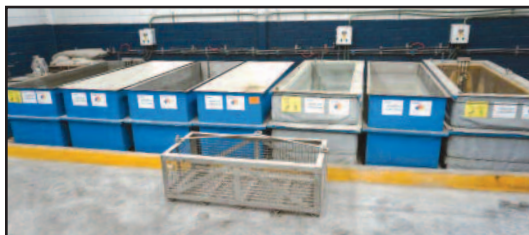
Phosphate and Magnesium Line