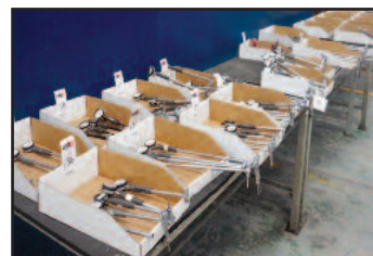
View of Mitutoyo Bore Gages