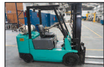
Mitsubishi LPG 5,800 Lb. Forklift

TERMS AND CONDITIONS: Payment must be in U.S. Dollars. Payment, including 18% Buyer's Premium, is due within 3 business days of receipt of invoice. Valid Bill of Lading must be shown and on file with MNA to avoid local sales tax. No exceptions. Any item/lot not removed by TBD, shall be deemed to be abandoned. By placing a bid, bidder acknowledges and expressly assents to each of the terms and conditions of auction found on the MNA website and auction catalog.