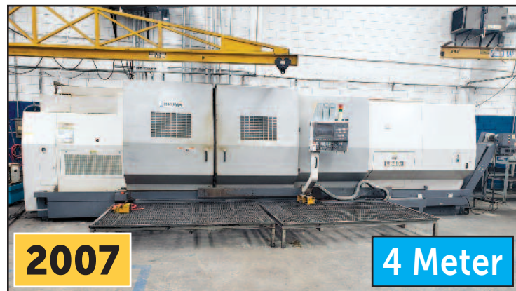
Okuma LB45IIR-C 3000 Turning Center