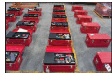
Multiple Tool Boxes