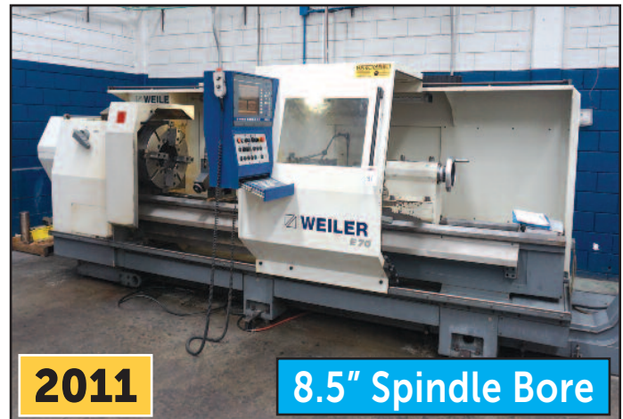
Weiler E70X3000 Hollow Spindle Flat Bed CNC Lathe

ONSITE & ONLINE AUCTION: Thursday, October 10th @ 10:00am CDT