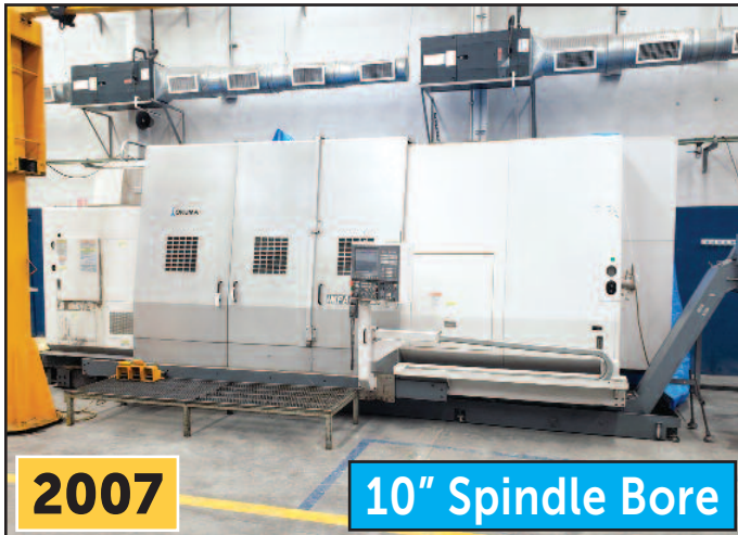
Okuma Impact LU-45 3000 Turning Center