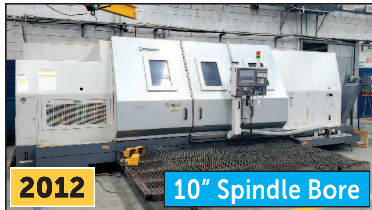
Okuma Impact LU-45 3000 Turning Center