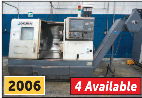
Okuma LB4511C 3000 Turning Center