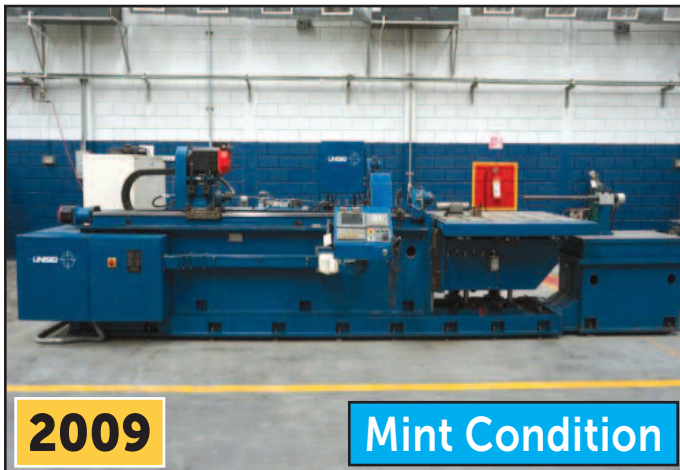
Unisig USK38 CNC Gun Drill