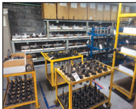
View of Toolroom