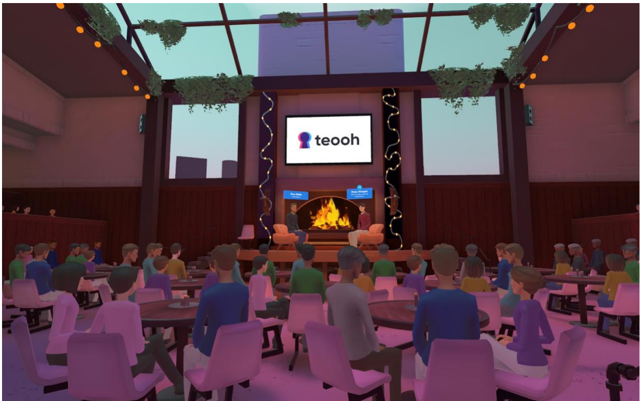
Here's a community in London gathered together waiting for a live stream to start of a traditional event that's occurring in San Francisco.