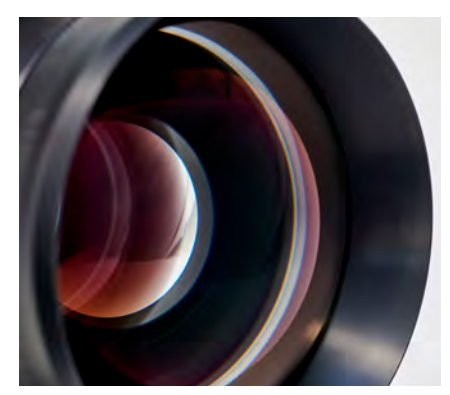
■ Perfect interplay between high-quality technical components