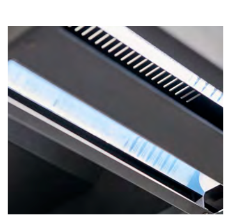
■ LED lighting system for reflection-free and shadow-free results