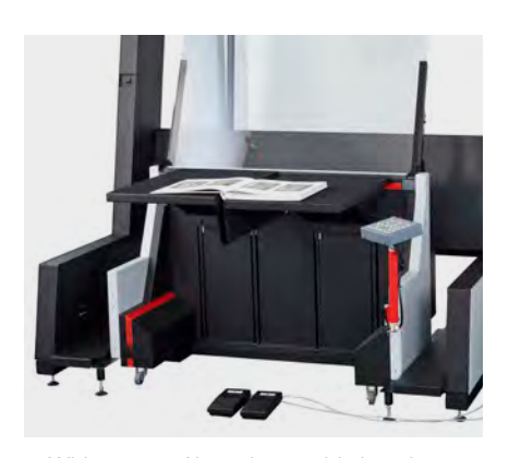
Wide range of interchangeable imaging systems