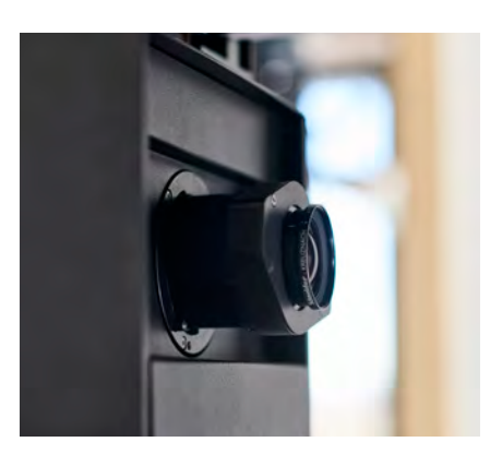
■ Optional: optical zoom