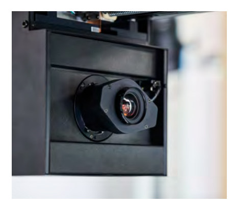
■ Completely new developed camera system based on a CMOS sensor