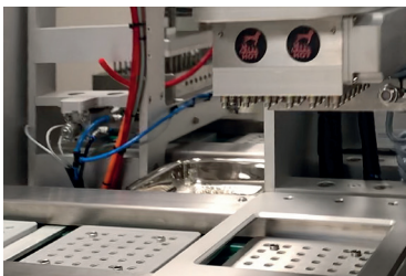
TECH DEVELOPMENT CENTRE