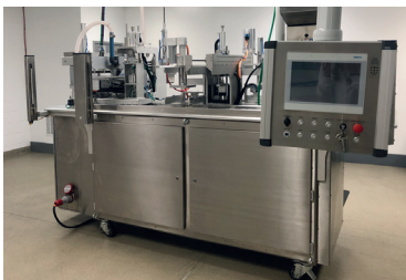
OWN BUILT MACHINES