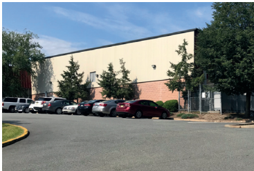
PLANT & SUPPLY