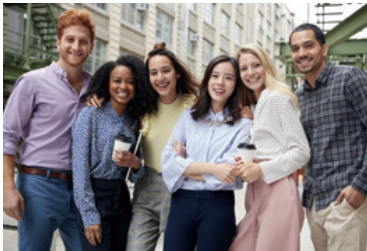
CUSTOMERS & PRODUCTS