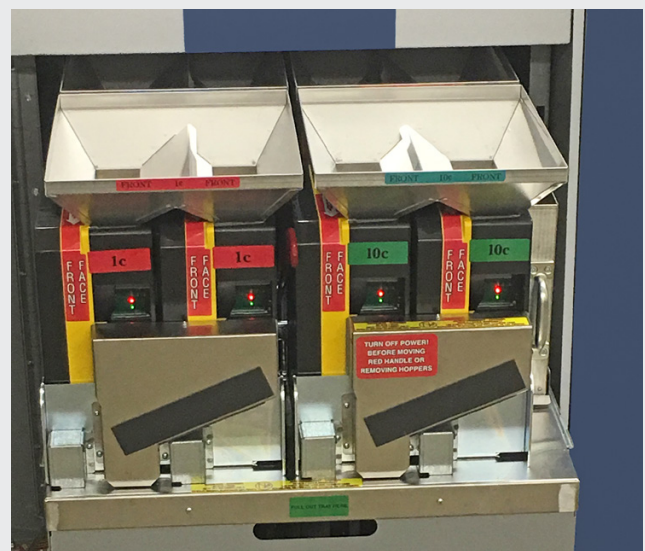
AC7500 Coin Hoppers

Many companies have seen ROI in as little as 12 months