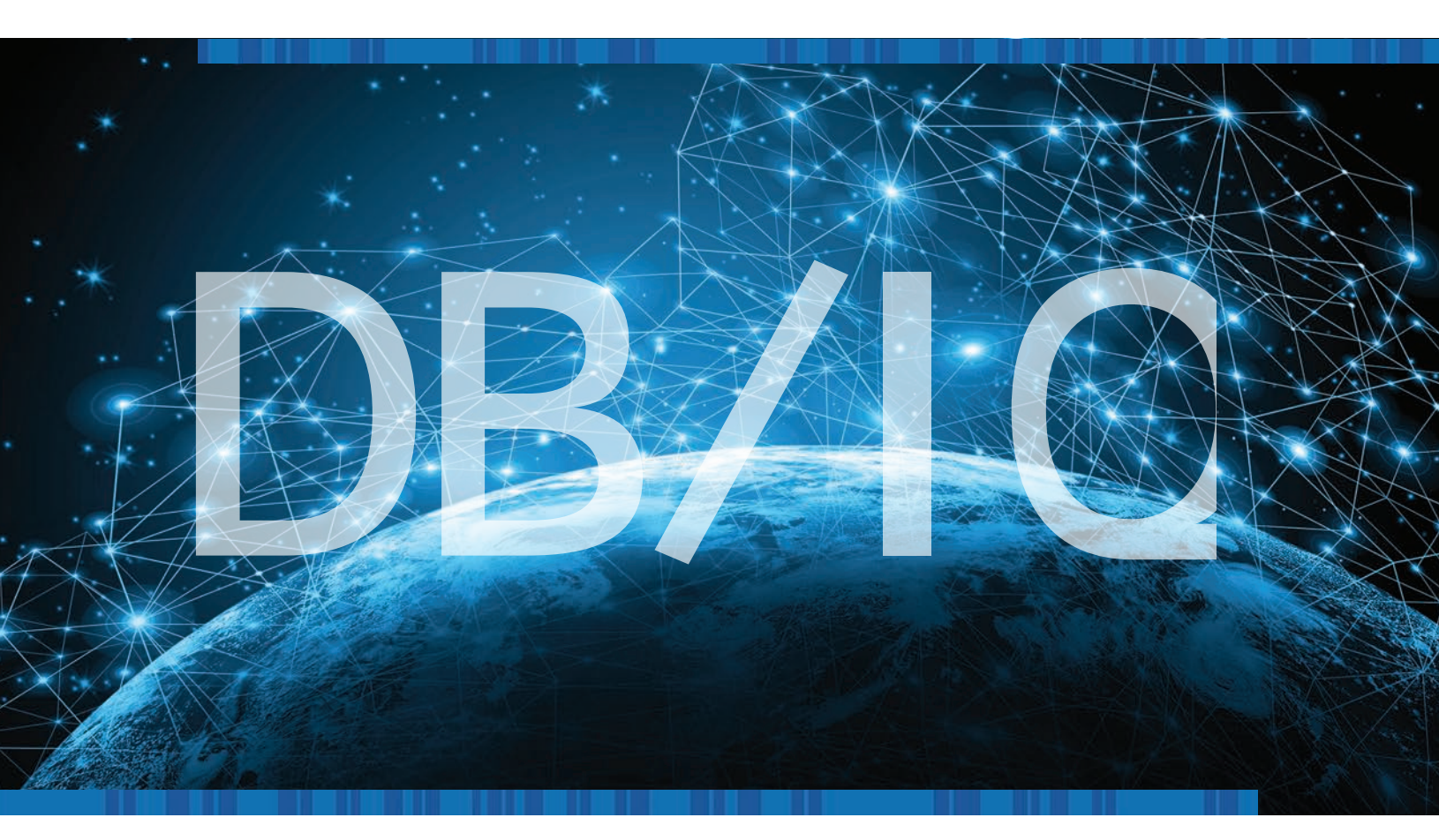
SQL Code Quality Assurance | Improved Db2® Performance