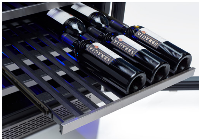
Full-Extension Wood Racks