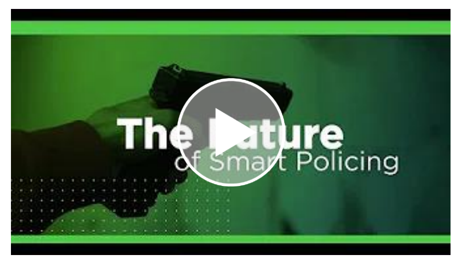
FŪSUS IN 30 SECONDS (30 SECS)