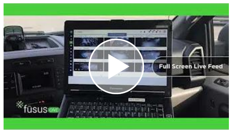
FŪSUS ONE SQUAD CAR DEMO (41 SECS)