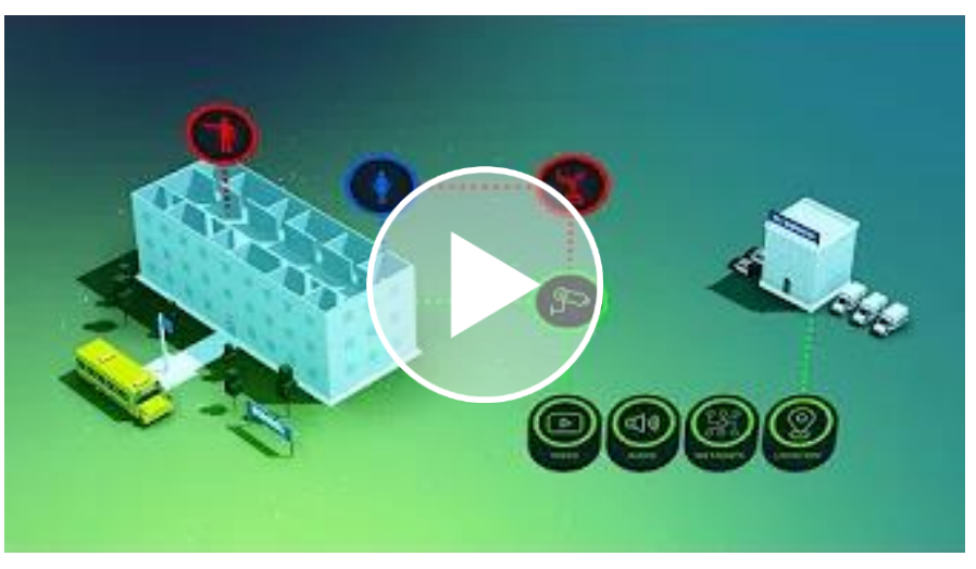
FŪSUS OVERVIEW (2 MINS 30 SECS)