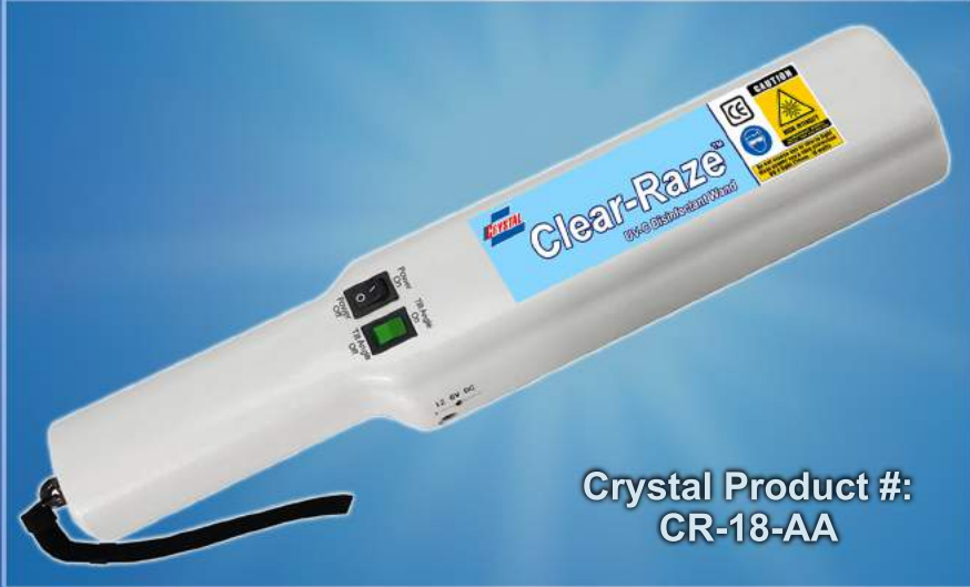
Crystal Product #: CR-18-AA

The Clear-Raze series of Handheld UVC wands provide UV radiation with a wavelength of 254nm.