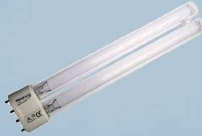
UVC Replacement Bulb Crystal Product #: CR-L-18