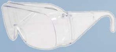
UVC Safety Glasses Crystal Product #: BG-Glasses