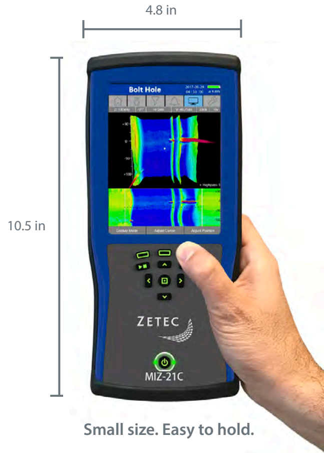
Small size. Easy to hold.

Assessing and Sizing Cracks in Raised Welds and Friction Stir Welds. Surf-X Weld Probes can also conform to geometry changes associated with raised welds to simultaneously inspect for axial and transverse cracking in the weld cap, toe, and heat-affected zones. Surf-X array probes use position indicators on the probe to help with alignment to ensure the entire area of interest is inspected. The flexible nature of the Surf-X array probe allows for the inspection of flat surfaces including friction stir welds. The long-life wear surface has been tested to 10,000 ft.