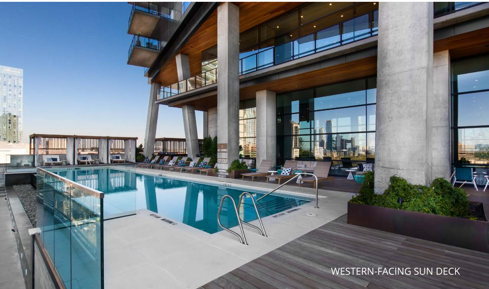
WESTERN-FACING SUN DECK

On the Northwestern corner of the 10th floor amenity deck sits the 72 foot-long infinity edge pool with unobstructed views of Lady Bird Lake and the downtown Austin skyline. This chlorinated, 4.5' foot-deep pool is temperature controlled to accommodate year-round use.