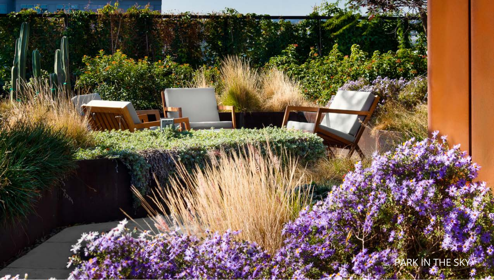
PARK IN THE SKY

70 Rainey's expansive landscaped 10th floor amenity deck is an elevated oasis featuring over 50 plant species, thoughtfully intertwined with the deck's outdoor lounge and gas fire pits, grill-equipped kitchen, pool-side cabanas, outdoor gaming lawn, spacious herb garden, fenced dog park, garden-wrapped bistro seating, meandering walking path, and secluded plunge pool.