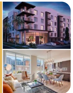
DAY 3 In long-term housing