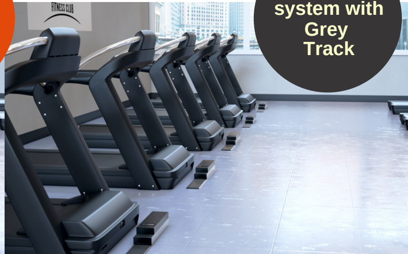
Standalone system with Grey Track