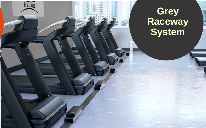
Grey Raceway System