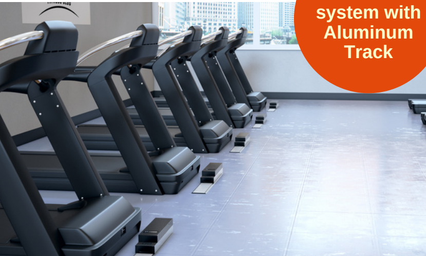
Standalone system with Aluminum Track