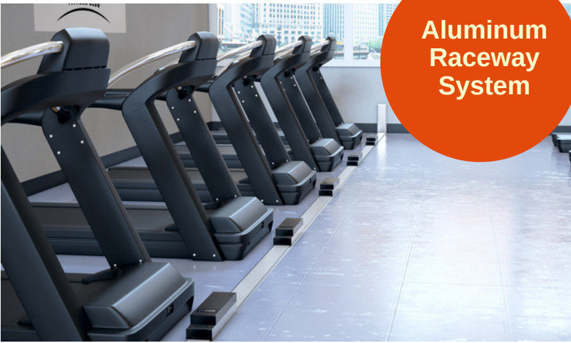
Aluminum Raceway System