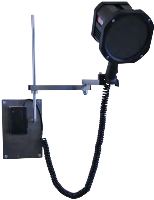
POSITION ON A FLEXIBLE ARM (PIN: A536)