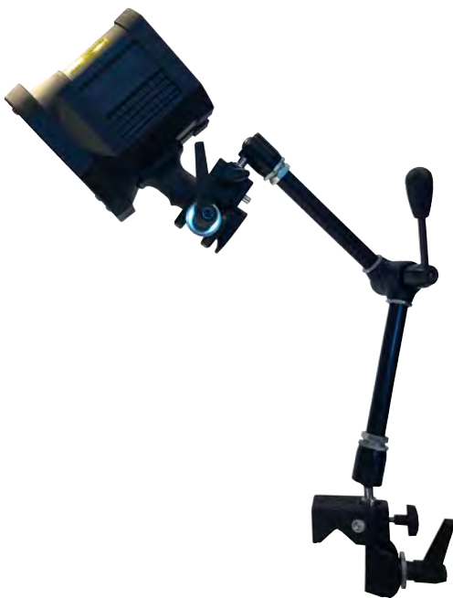
MOUNT ON A FRICTION ARM (PIN: A530)