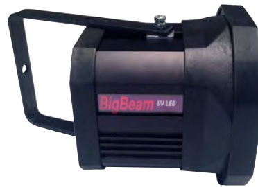
MOUNT WITH MOUNTING YOKE (PIN: F800 & F801)