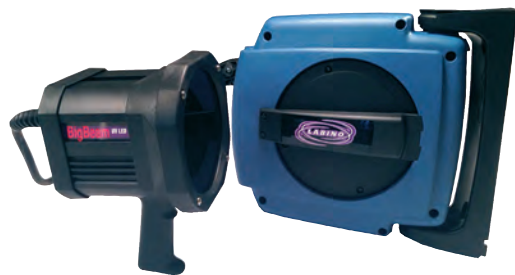
MOUNT ON A CABLE WINDER (PIN: F175)