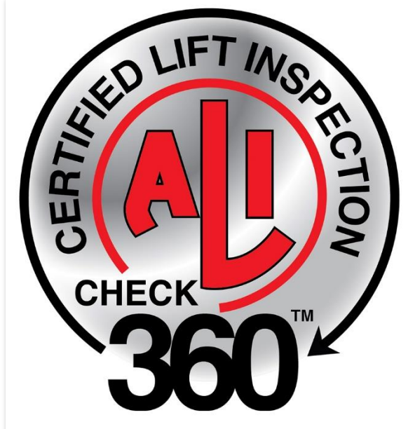
New Check360™ Certified Lift inspection logo

The standard requires that all vehicle lifts be inspected by a qualified lift inspector at least annually and provides extensive guidance on what must be inspected.