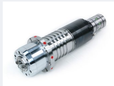
12,000RMP Direct Drive Spindle