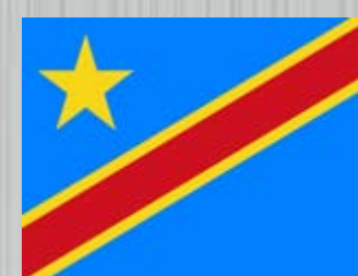
Goma North Kivu DRC