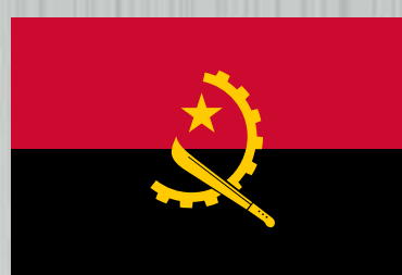
Luanda & Huambo Angola