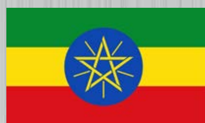
Addis Ababa Ethiopia