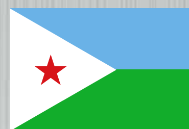
Djibouti City Djibouti