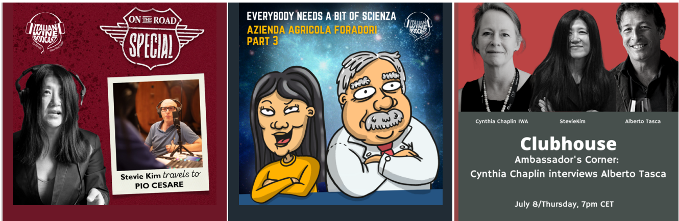
Italian Wine Podcast Episode Snapshots of this Week

The Italian Wine Podcast channel has achieved 1,049,791 streams on SoundCloud, 23,700 on Ximalaya and 25,230 on Spotify. The high-quality content speaks for itself, so happy birthday to us!