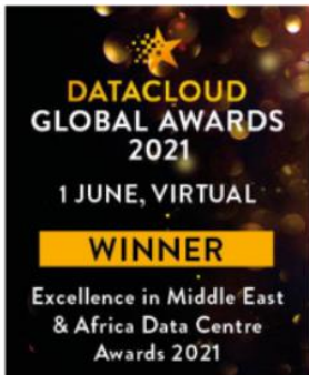
Excellence in Middle East & Africa Data Centre Awards 2021