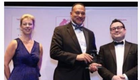
Winner of the 2018 Capacity Europe Global Carriers Awards for the "Best Data Centre Innovation" category.