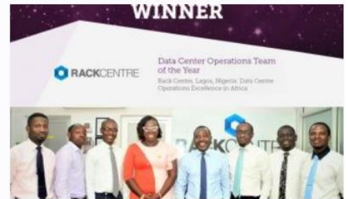
Winner of the 2019 Data Centre Dynamics (DCD) Awards for the "Data Center Operations Team of the Year" category.