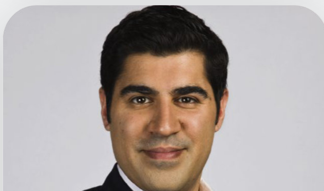
Dr. Parag Khanna