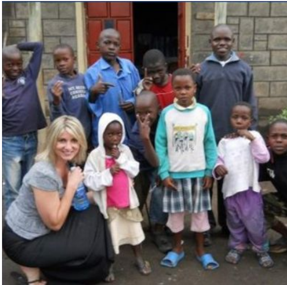
Mission Trip to Kenya, South Africa ~2010