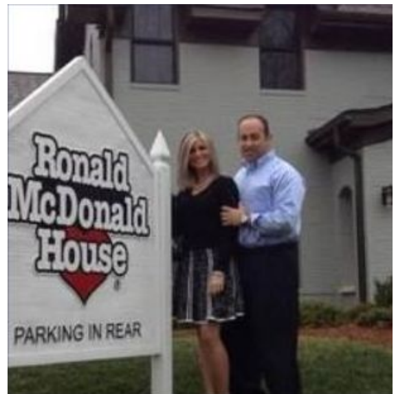
Ronald McDonald House Visit Greensboro, NC ~2013