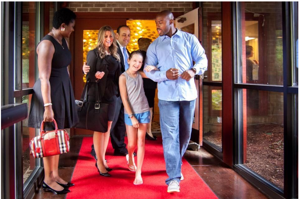
Ronald McDonald House Patient Release Celebration Day~2014 Chapel Hill, NC