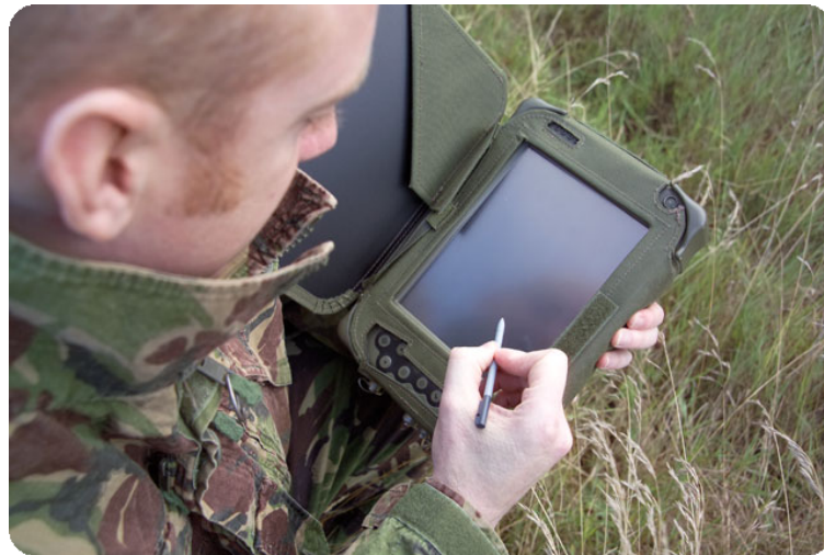
Description of Photo: An example of a resistive touch screen manufactured by Optical Filters USA.

“Once we have more data/history in the system we will be able to do some very detailed gross margin analysis by product group. This will provide invaluable information for strategic planning on product mix and markets.” -Nicola Dent, President of Optical Filters USA.