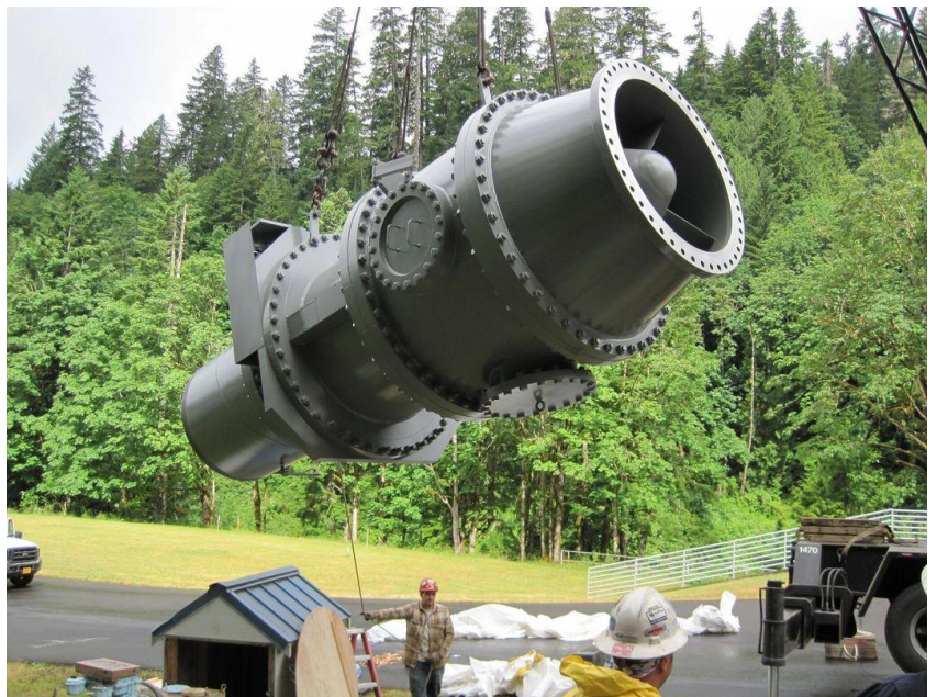
The above photo shows a Bailey Valve-54" B-10 Sleeve Valve