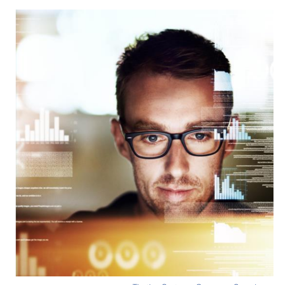
Thetica Systems Company Overview