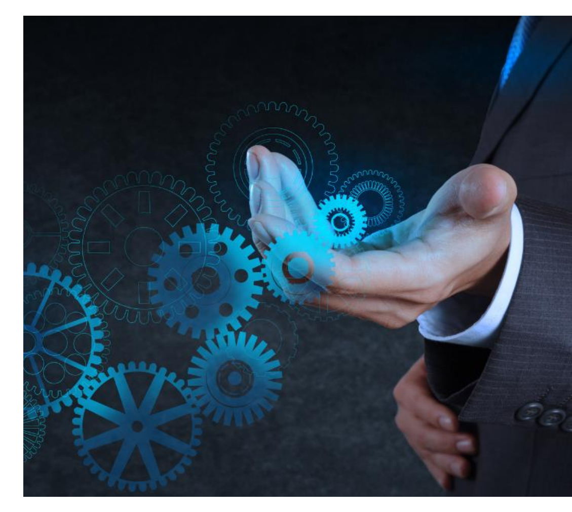
Thetica Systems Company Overview

Our decades of experience as an <u>Intex partner</u> and data integrator for structured finance are the heart of what differentiates us. We combine that specialized knowledge with our proven, proprietary infrastructure components to deliver a custom platform in a fraction of the time. And we can do this with all data, whether licensed externally or generated internally.