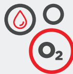
Blood Oxygen Saturation