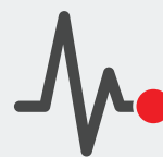
ECG Heart Rhythms