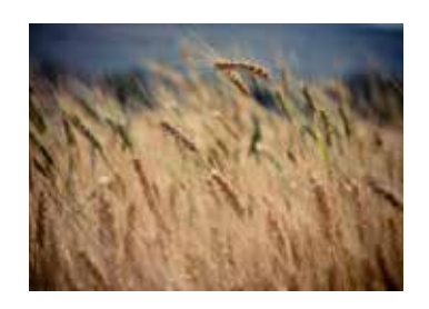
CONSISTENT SOURCE Largest Independent Supplier of Bulk High Proof Spirits

Signature Spirits can get your new spirit brand to market better, faster and more economically than anyone else in the industry. We have the largest selection of alcohols in the world and the most extensive network of formulating and bottling expertise in the country.