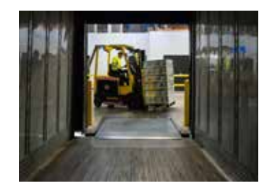
COORDINATION Downstream Marketing for Your Wholesale and Retail Launch