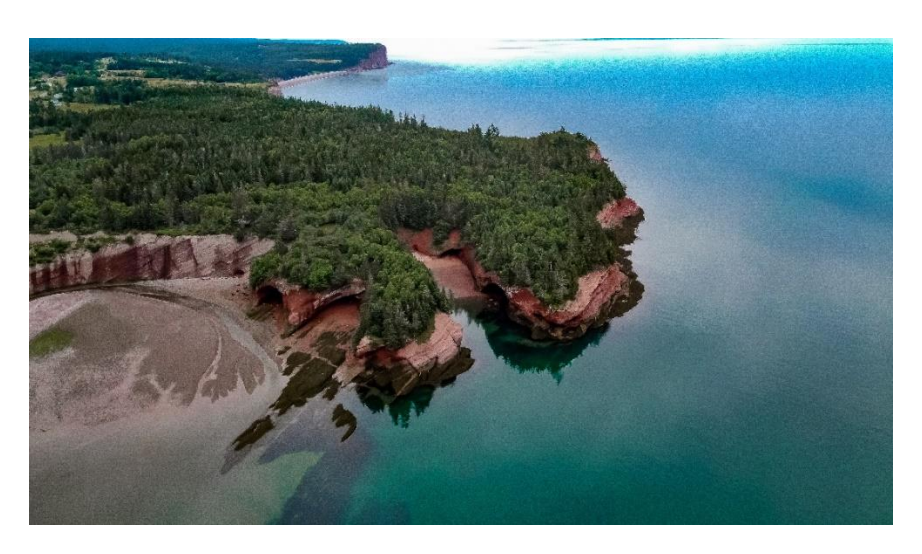
Saint Martins Sea Caves

Atlantic Canadian Province is Home to the Highest Tides in the World, a Waterfront Container Village, Seaside Bike Trails, and More