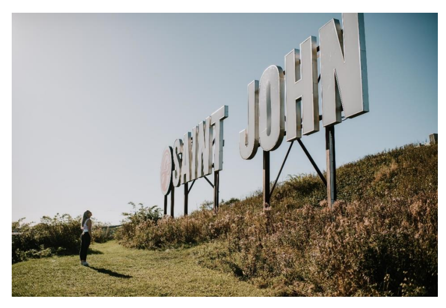
Saint John, New Brunswick

FREDERICTON, NEW BRUNSWICK (XXX) - Located just across the U.S. border from Maine, New Brunswick, Canada, welcomes travelers this year with family-friendly coastal experiences that explore its rich wildlife, vibrant cities, and awe-inspiring tides of the Bay of Fundy. Visitors will find newly refurbished accommodations, kayaking and biking adventures along with opportunities to enjoy the Atlantic Canada province's Acadian heritage and vibrant cities.