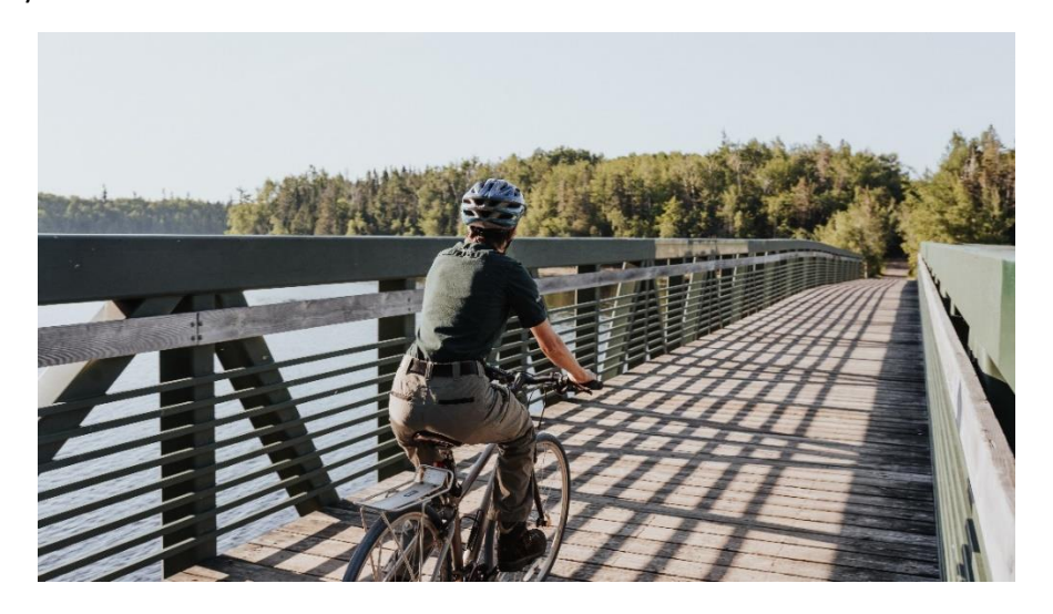
The Véloroute Bike Trail

New to Saint John, Canada's oldest incorporated city, is the <u>Waterfront Container Village</u>. This village of shipping containers transforms a parking lot into a diverse collection of retail shops, eateries and a bar, a large stage performance space, pop-up activities, and a beer garden with views of the Bay of Fundy. This lively area will be made up of more than 60 shipping containers that represent the vibrant and eccentric personality of Saint John. The Waterfront Container village will mirror the cruise ship schedule, which runs from early June to mid-November.