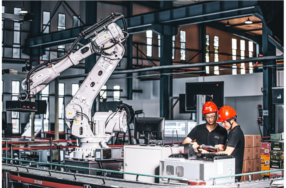
The above photo shows manufacturing employees using a tablet at their workstation.

With Cetec ERP, manufacturing employees can pull up work orders on mobile tablets, allowing users to complete jobs efficiently and effectively from anywhere. The all-in-one simple and affordable model Cetec provides to customers gives ERP access at a low-cost to manufacturers across the world.