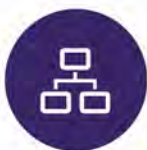
Read Only Mode