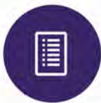
Data Subject Whitelisting