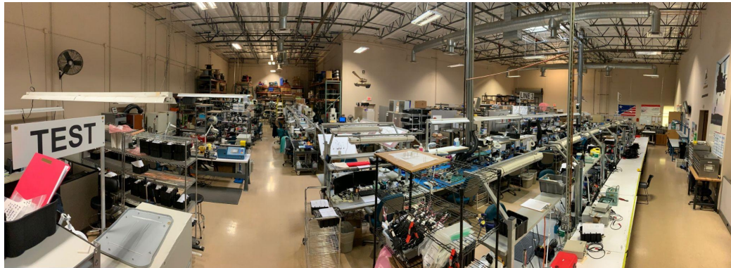
The above photo shows a snapshot of CEPA's Manufacturing Warehouse