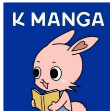
K MANGA App Top UI