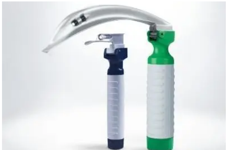
The above photo shows a GoldStar Medical Instruments' single-use laryngoscope.