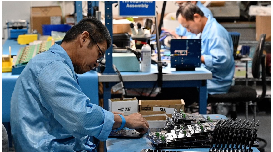
The above photo shows an East/West employee working on a parts assembly.